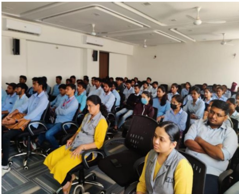
Screenshots of the workshop on UI/UX Design