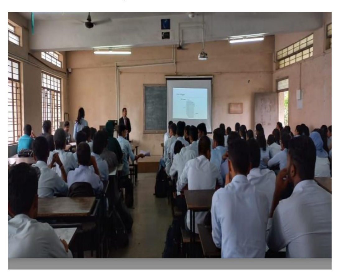
Screenshots of the workshop on Generative AI.