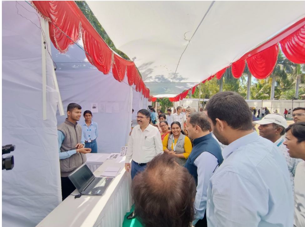
Photo with Election Commissioner of Chh. Sambhajinagar at MIT Student Project Stall