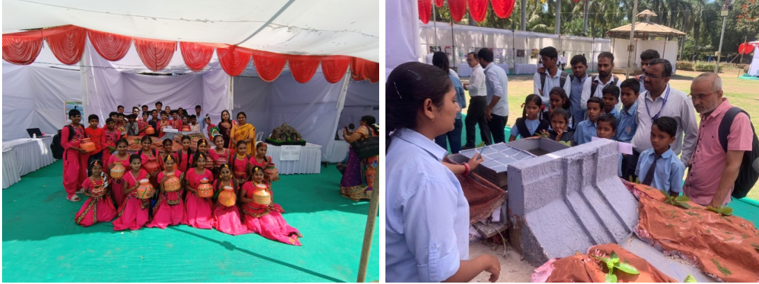
Participant Photos at MIT Student Project Stalls