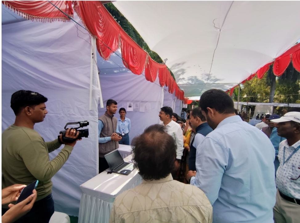
Photo with Election Commissioner of Chh. Sambhajinagar at MIT Student Project Stall