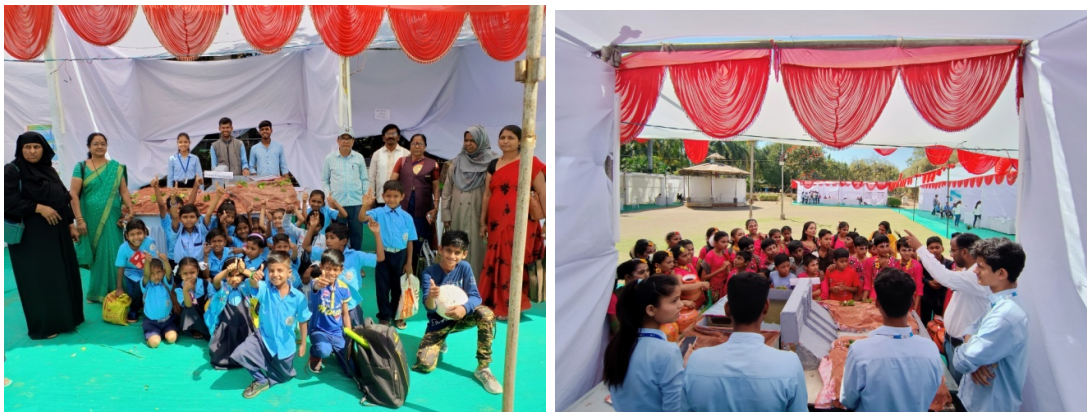
School children with MIT Student Group for understanding technical projects