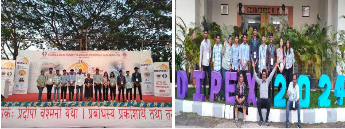
MIT Students with HOD Civil Engineering