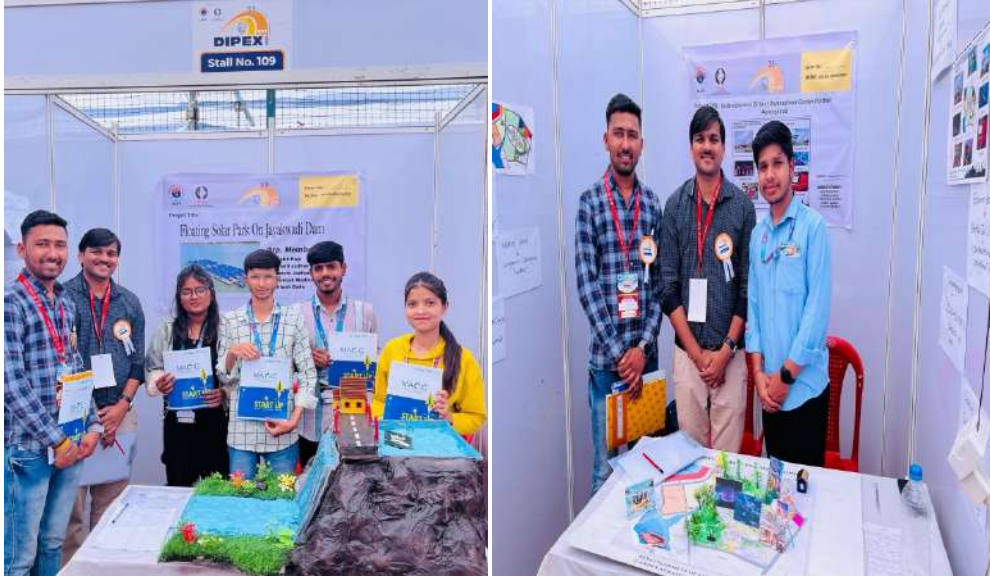
MIT Students explained project with MAGIC incubation team